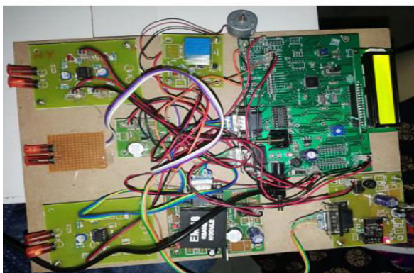
Fig.3.1. Working model.

MOBILE. In attaining the venture the controller is loaded with an application written using Embedded „C“ language. The user who wants to park the automobile is hooked up to the Wi-Fi community of that precise parking lot thru the password. The IR sensors ship the status to the microcontroller in which the data processing is completed. The microcontroller sends data to the webpage approximately the status of the slot to the consumer the usage of IOT. This manner the consumer can without problems discover a parking spot with none congestion and in much less time.