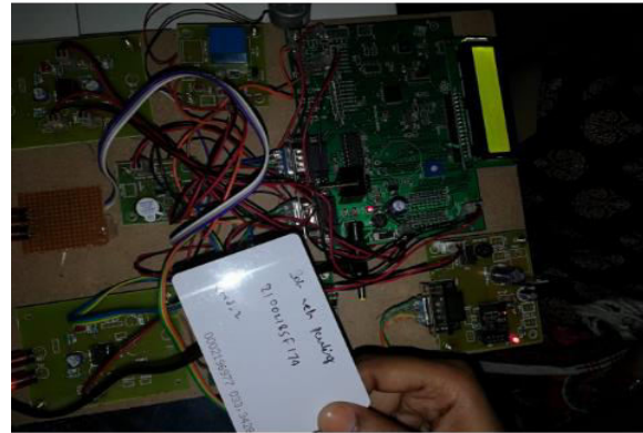
Fig.3.2. RFID card using for Online registration.